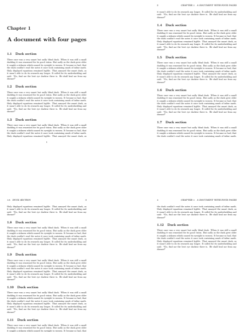
Figure 2: Example of pdfpages output.