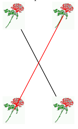
Same with psmatrix