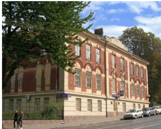
Figure 3. This is a sample of a bitmap image. This cosy building homes the Institute for Condensed Matter Physics and the CMP Editorial Office too.

Roughly speaking, there are two types of electronic figures: vector graphics and bitmap graphics. A vector image is a set of arranged objects: lines, polygons, ellipses, shades, characters, etc. Such an image allows almost arbitrary scaling without loss of quality. Vector images are typically charts, plots, diagrams, etc., produced by various computer software. A bitmap image is a two-dimensional array of pixels (PICTure'S ELEments) or "dots". Continuous tone photographs are their the most widespread samples (like figure 3). Image quality is determined by DPI (Dot Per Inch — a pretty self-explained definition). Below, there are necessary requirements for each type of images.