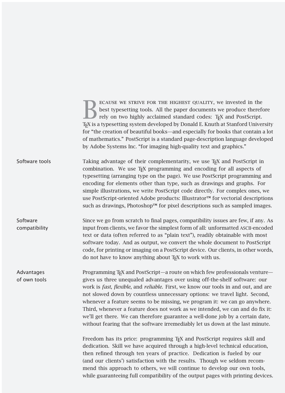
Figure 1 (next two pages) The two pages on our using T E X and PostScript, out of a short document explaining our approach to our clients.